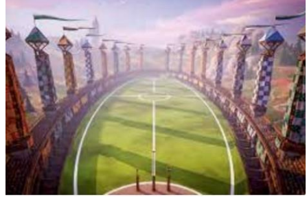
Monday 4th March 2024 Quidditch tournament KS1 (PM) This will be a fun activity taking place in school in the afternoon.