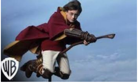
Tuesday 5th March 2024 Quidditch tournament KS2 (PM) This will be a fun activity taking place in school in the afternoon.