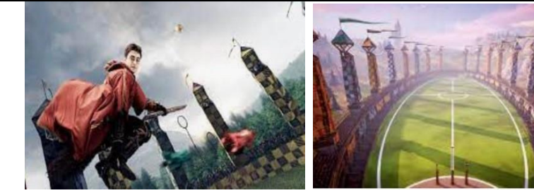
Monday 4<sup>th</sup> March 2024 Quidditch tournament KS1 (PM) This will be a fun activity taking place in school in the afternoon.