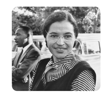
Rosa Parks wanted black people to have the same rights as white people.