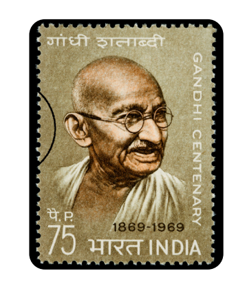
Stamp of Mahatma Gandhi