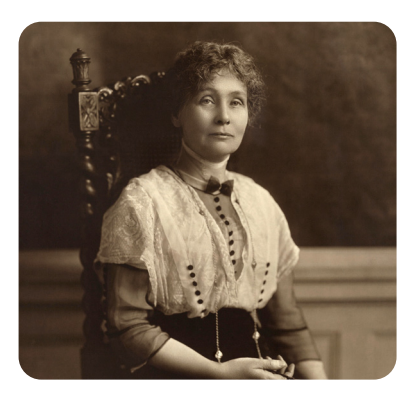
Emmeline Pankhurst stood up for women's rights.