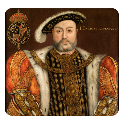
Henry VIII was the king who formed the Church of England.