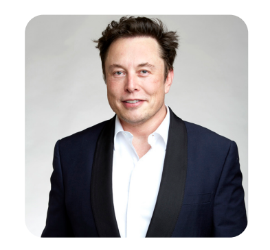
Elon Musk is trying to make a rocket to go to Mars.