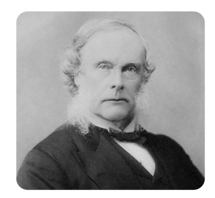
Joseph Lister found out that dirty conditions in hospitals caused infections.