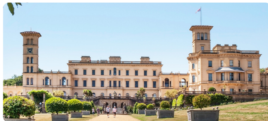
Osborne House is on the Isle of Wight, England.