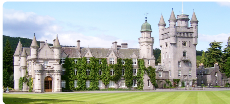
Balmoral Castle is in Aberdeenshire, Scotland.