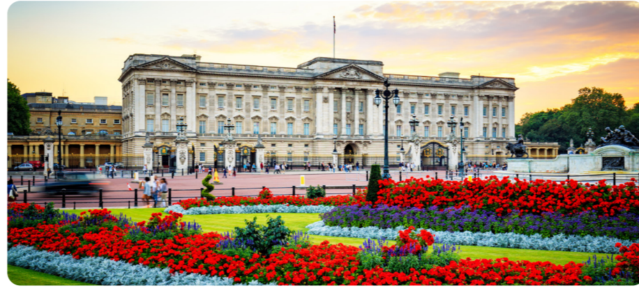
Buckingham Palace is in London, England.

Royal residences include palaces, castles and stately homes. Some of them are used for official royal business. Some are used as holiday or private homes. Many are tourist attractions.